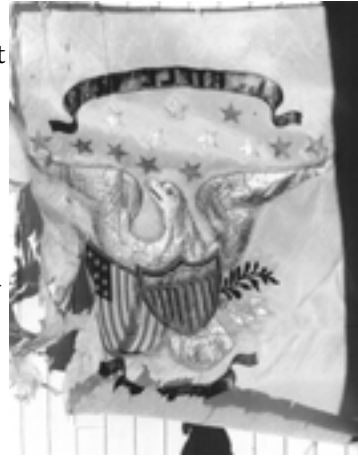
Grantham Militia Flag from GHS Collection

Note: The Grantham Historical Society is working on comprehensive lists of all men and women who were or are veterans, either born in Grantham or living here at the time of their enlistment. Since many of our lists are inconsistent, we would appreciate hearing from anyone who either has new names to add or who wants to check our lists to make sure family members are accounted for. You may leave a message at 863-7901 or email granthamhistoricalsociety@gmail.com . Your help with this project would be very much appreciated.