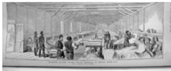
Civil War engraving of Hilton Head, SC Hospital